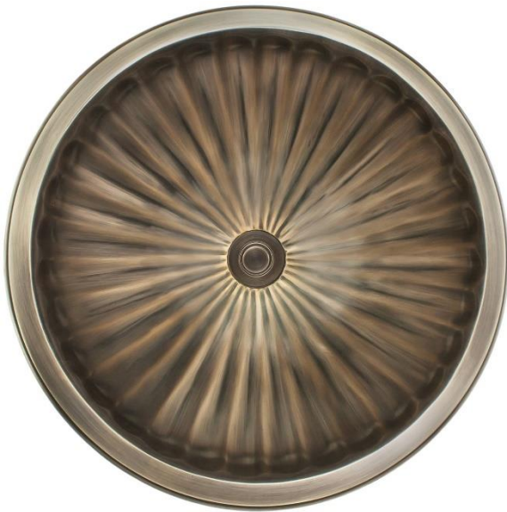
SHOWN IN AB

Linkasink warranties our product to be free from manufacturing defect for the life of the product. Warranty does not cover improper care or abuse/neglect, or changes to the living finish.