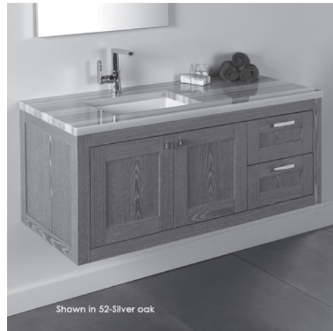
Shown in 52-Silver oak