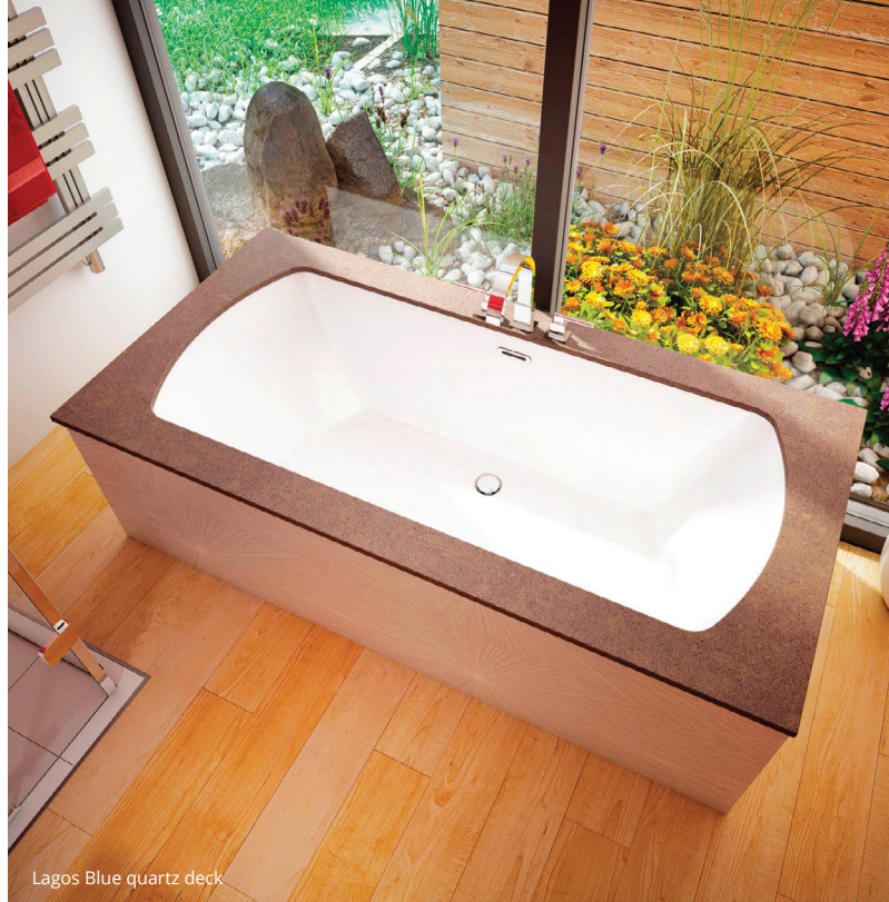
Lagos Blue quartz deck